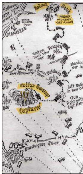
Pictured is an illustration of "the chase" from the Sept. 29, 1934 issue of Detective Fiction Weekly